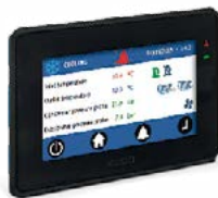
Latest-generation touch screen user terminal.