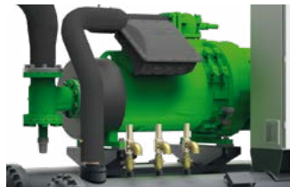
High efficiency screw compressors designed for R513A refrigerant gas.