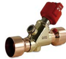
Electronic expansion valve.