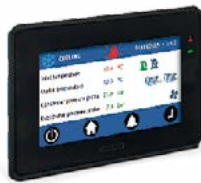
Latest-generation touch screen user terminal.