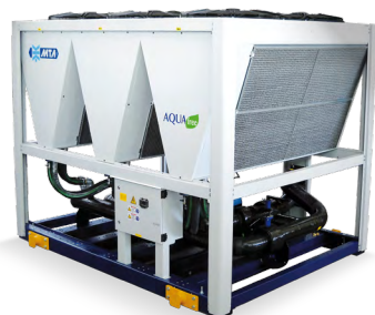
An Aquafree's range module